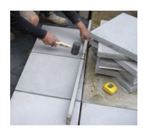
STEP 9. Check levels across pavers continuously and tap down if needed.