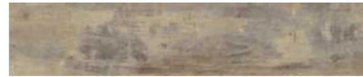
5847 Umbra Glazed Wood* 152mm x 1219mm