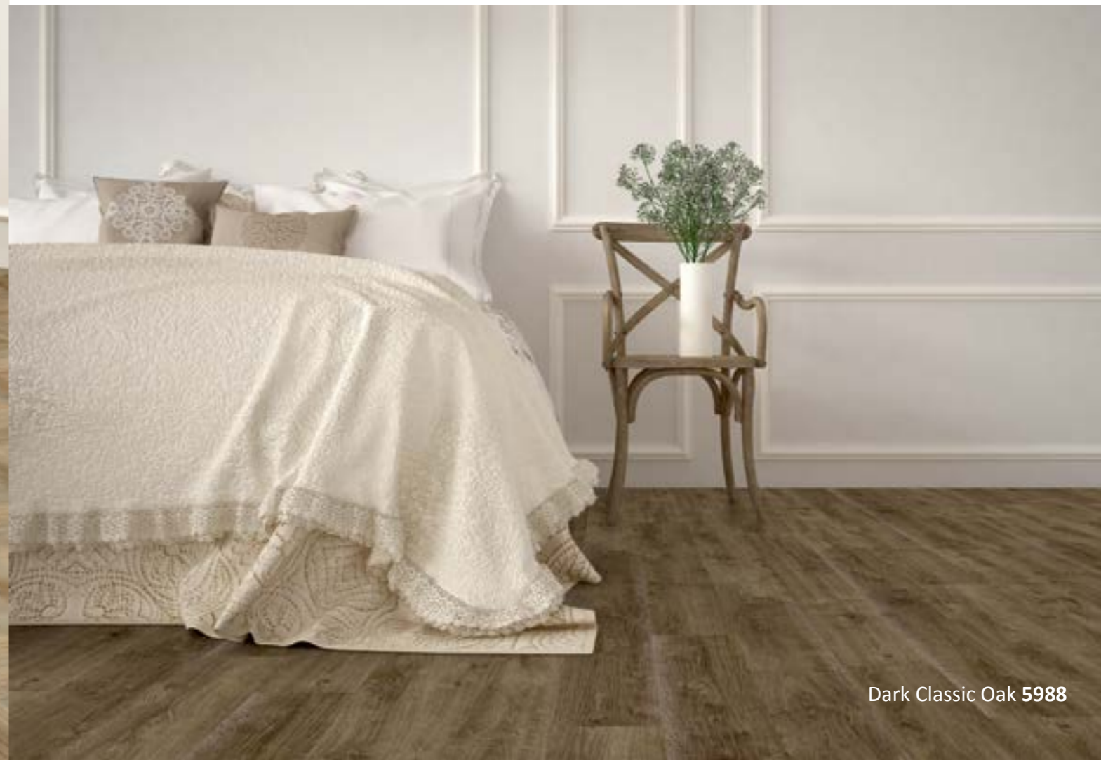
Dark Classic Oak 5988