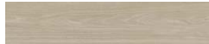
5975 Bleached Ash* 152mm x 1219mm