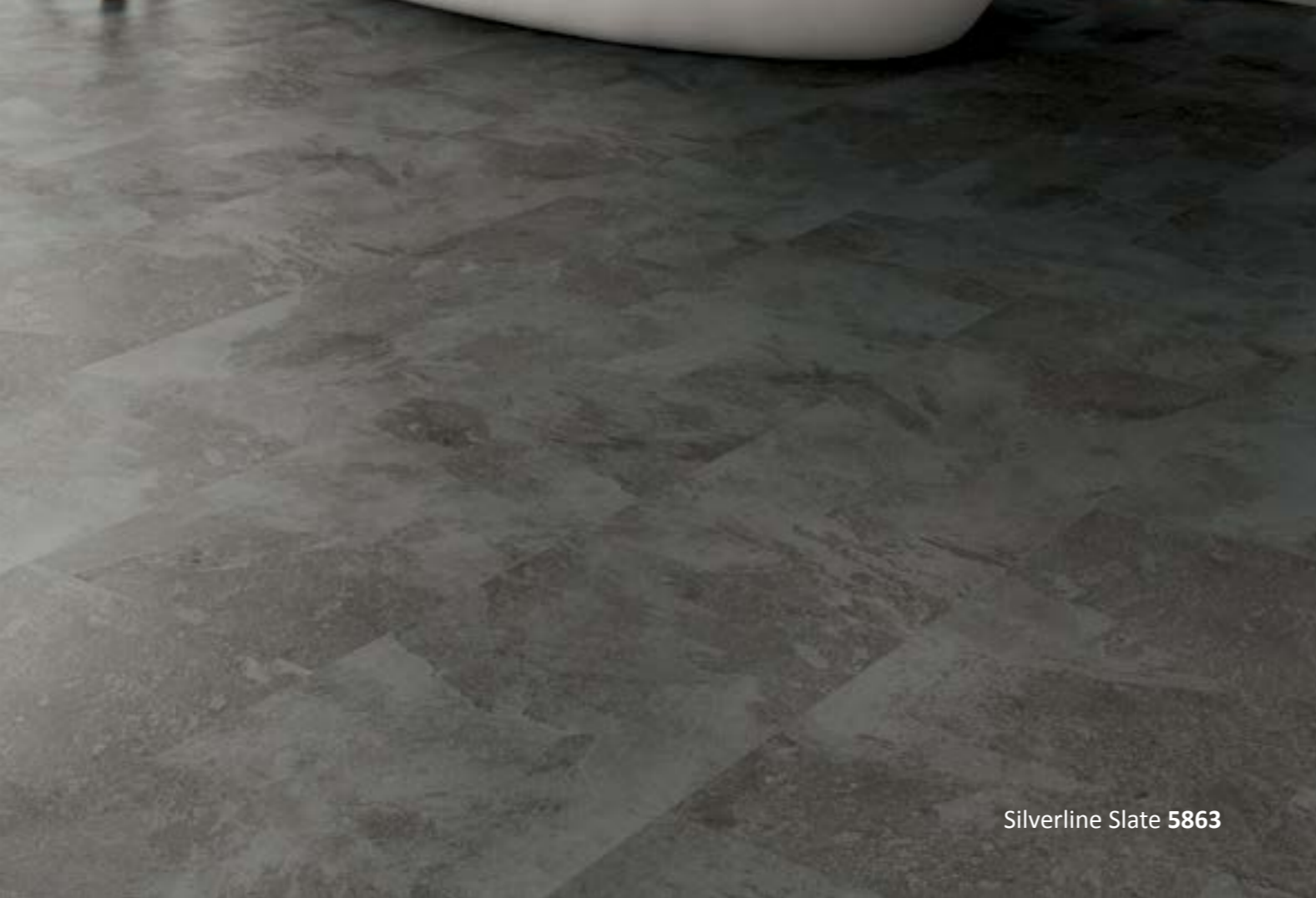
Silverline Slate 5863