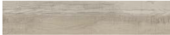
5828 Beige Saw Mill Oak* 184mm x 1219mm