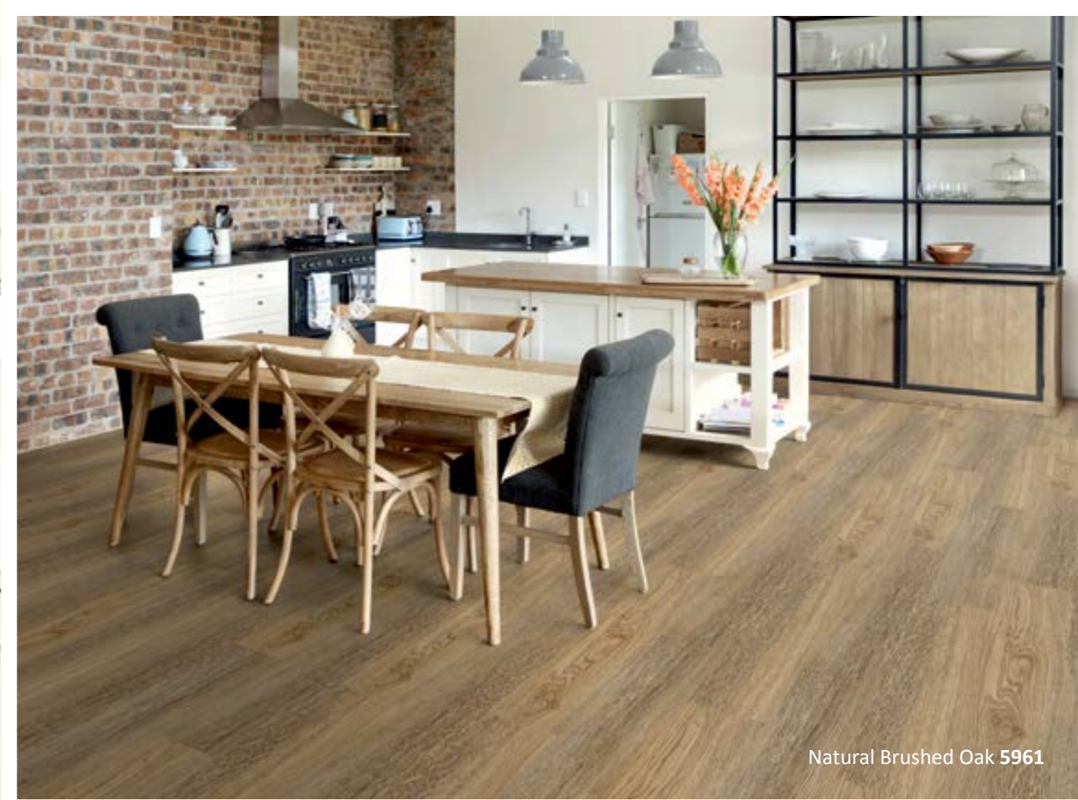
Natural Brushed Oak 5961