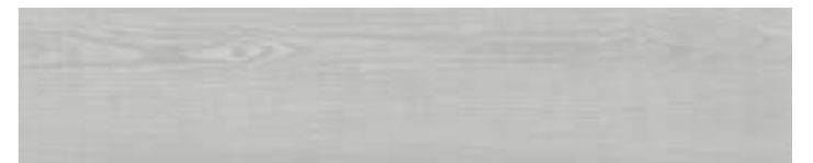
5991 White Saw Cut Ash 203mm x 1219mm