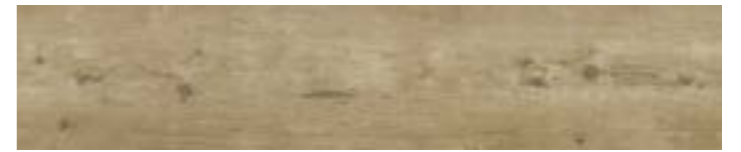
5950 Scandinavian Country Plank 152mm x 914mm