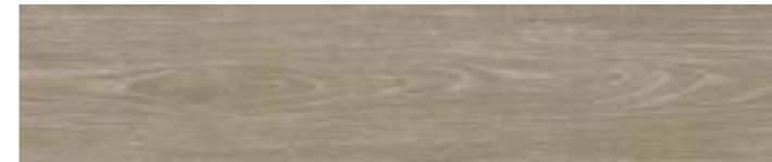
5962 Grey Ash* 152mm x 1219mm