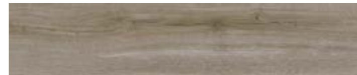
5967 Natural Oak Grey* 152mm x 1219mm