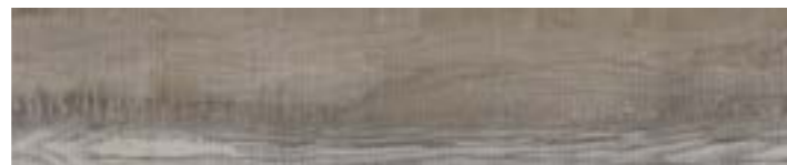
5845 Grey Saw Mill Oak* 184mm x 1219mm