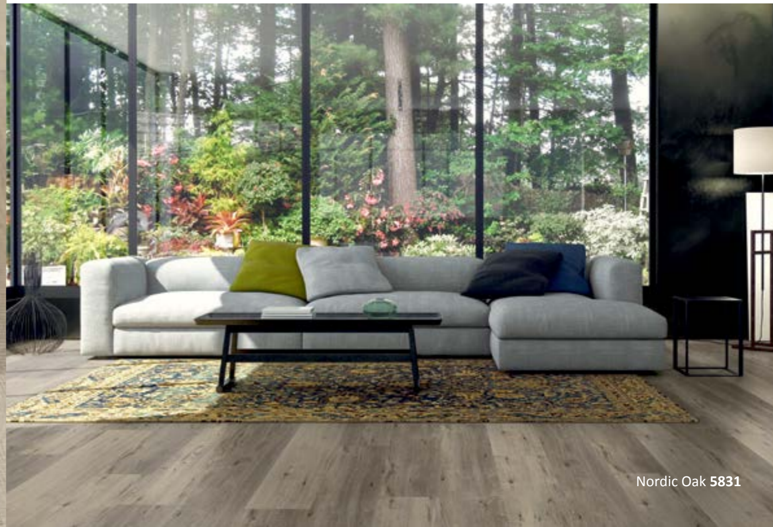
Nordic Oak 5831