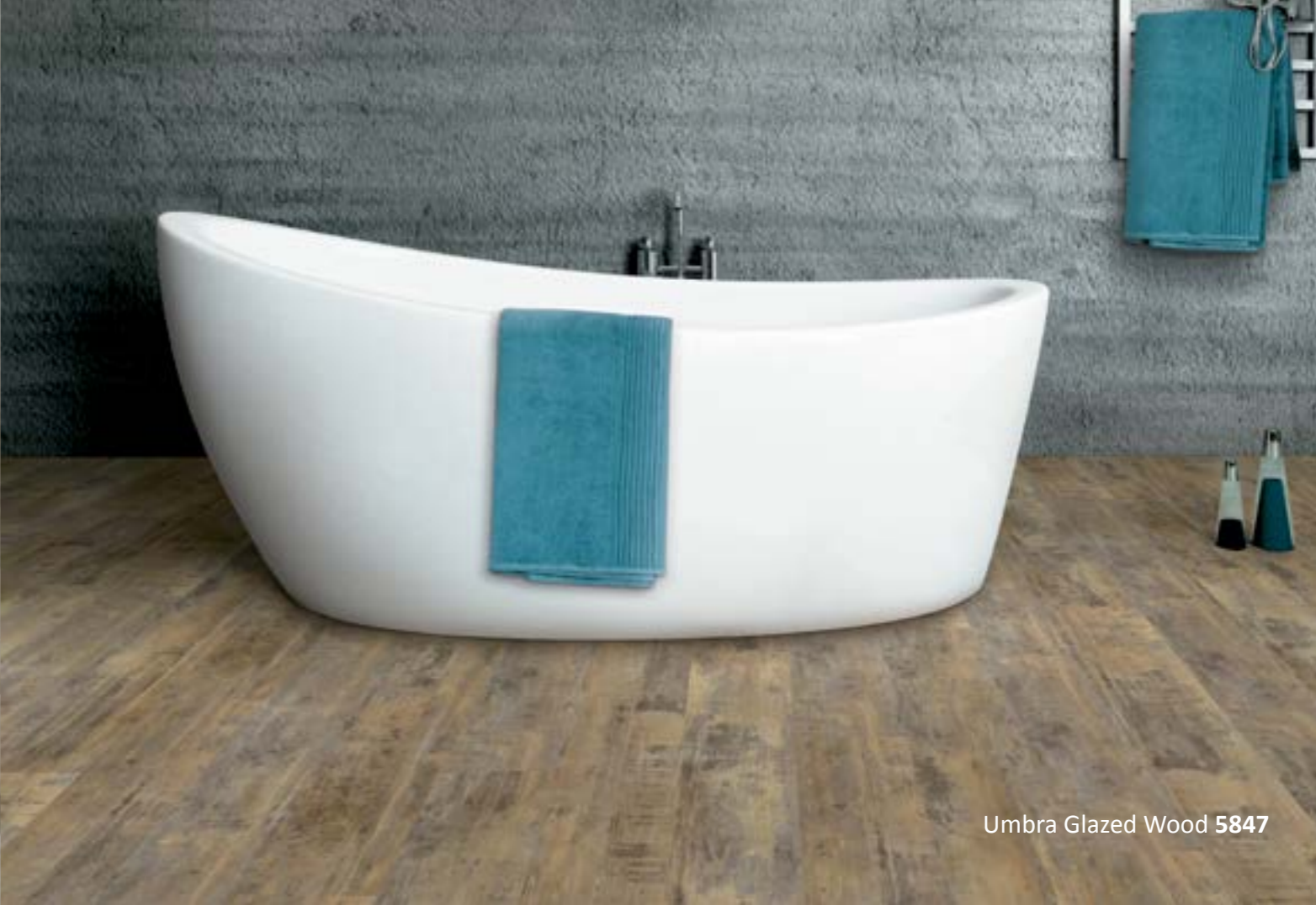
Umbra Glazed Wood 5847