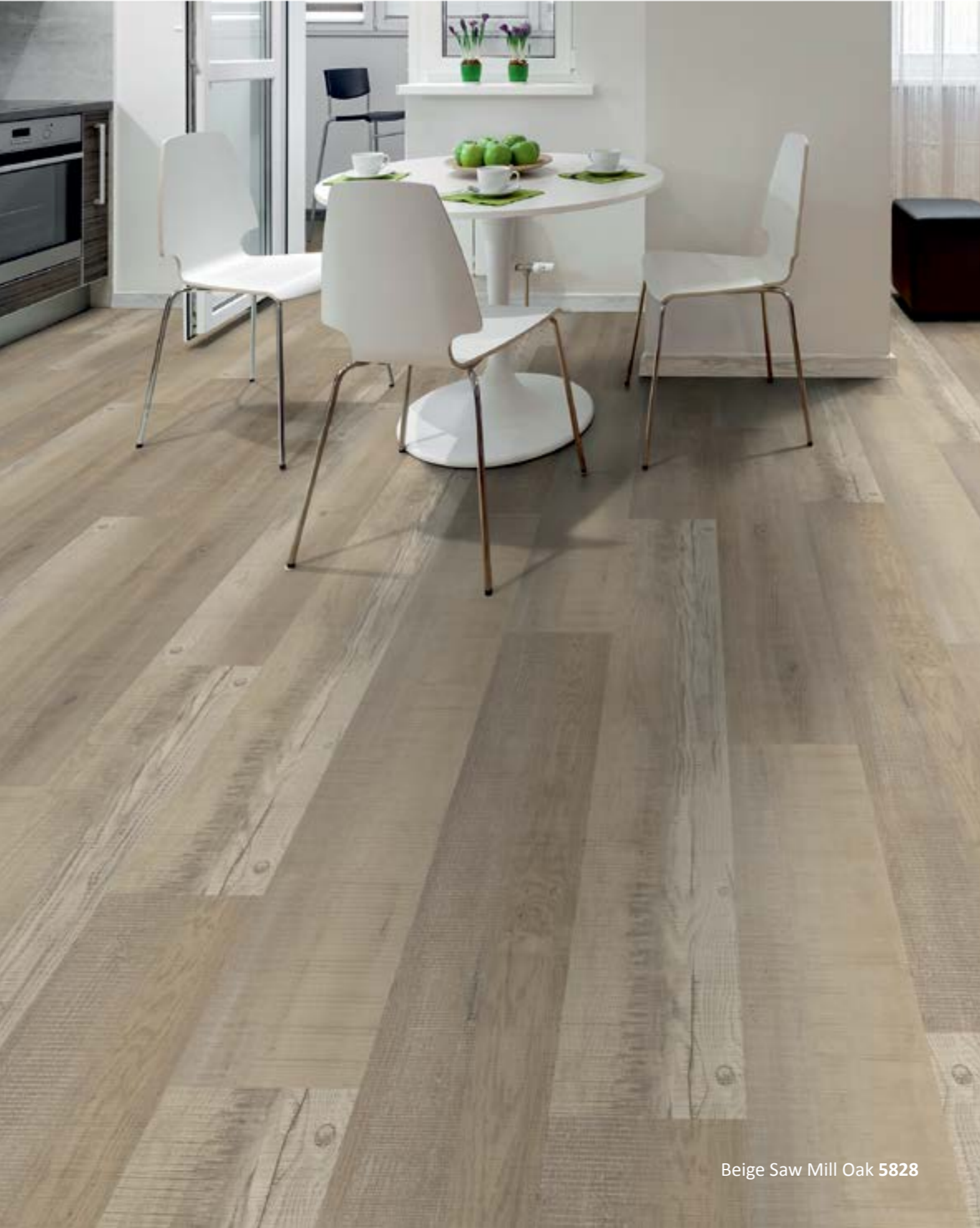
Beige Saw Mill Oak 5828

Whitewashed woods and pale, natural Scandinavian tones - a breath of natural freshness.