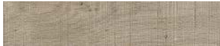
5829 Mill Oak Mini Parquet* 76mm x 229mm