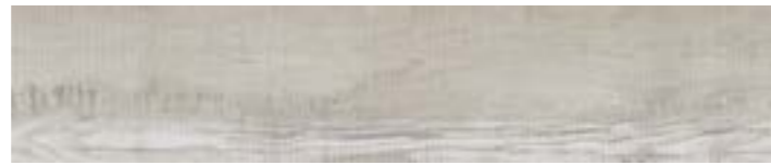
5824 Light Saw Mill Oak* 184mm x 1219mm