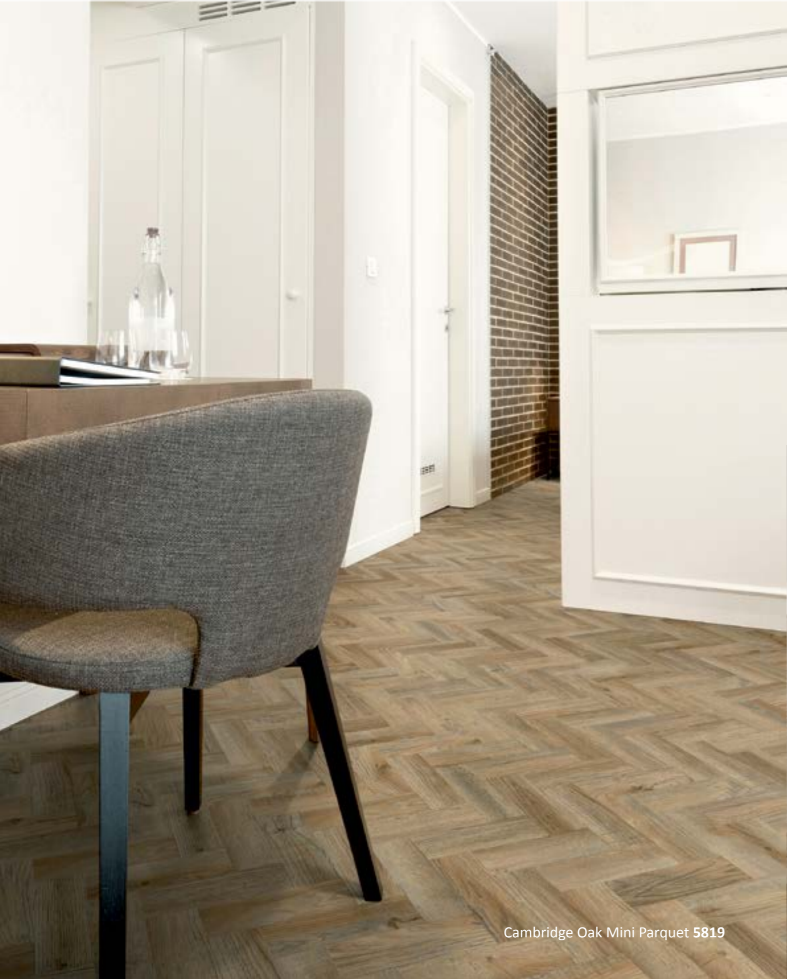
Cambridge Oak Mini Parquet 5819

From timeless classics to powerful, dark woods - for stunningly stylish designs.