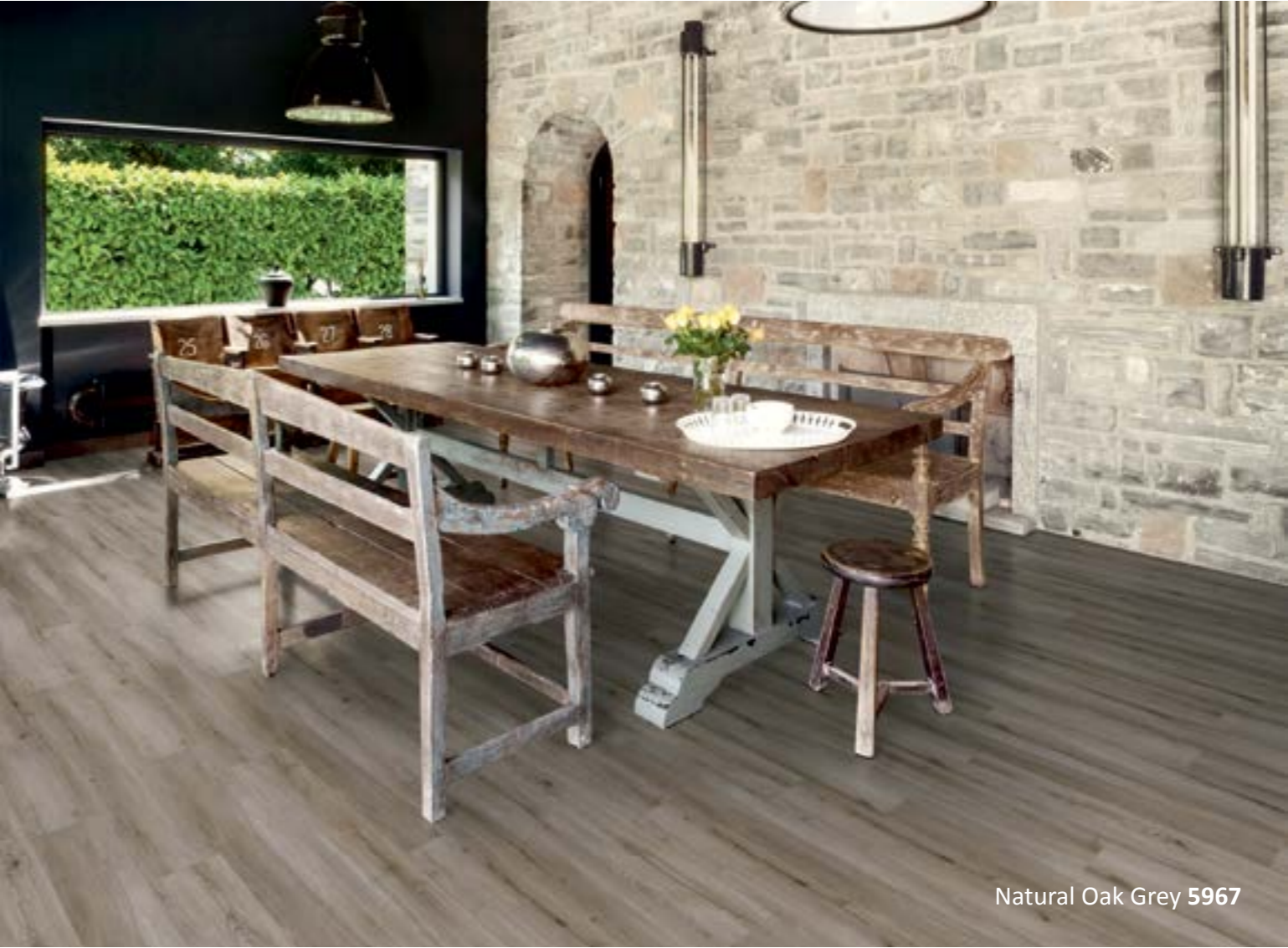
Natural Oak Grey 5967