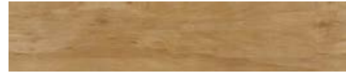
5953 Wild Oak* 152mm x 914mm