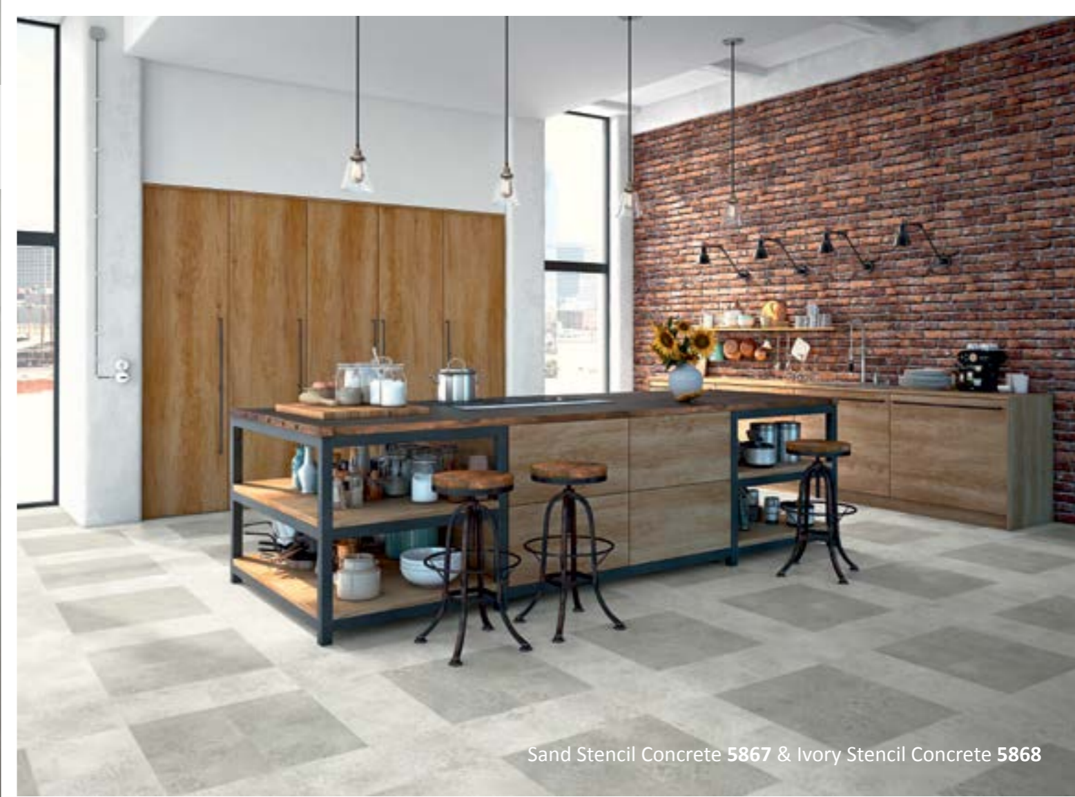
Sand Stencil Concrete 5867 & Ivory Stencil Concrete 5868