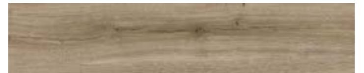
5968 Natural Oak Medium* 152mm x 1219mm