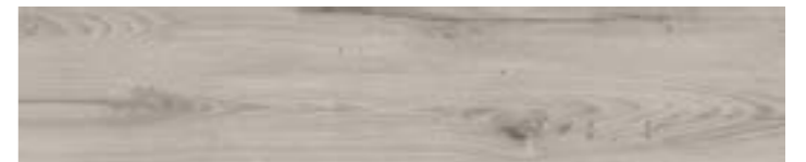
5982 Natural Oak Washed* 152mm x 1219mm