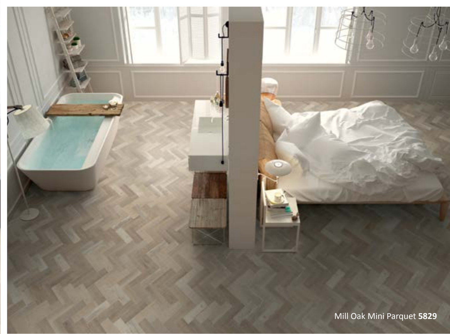
Mill Oak Mini Parquet 5829