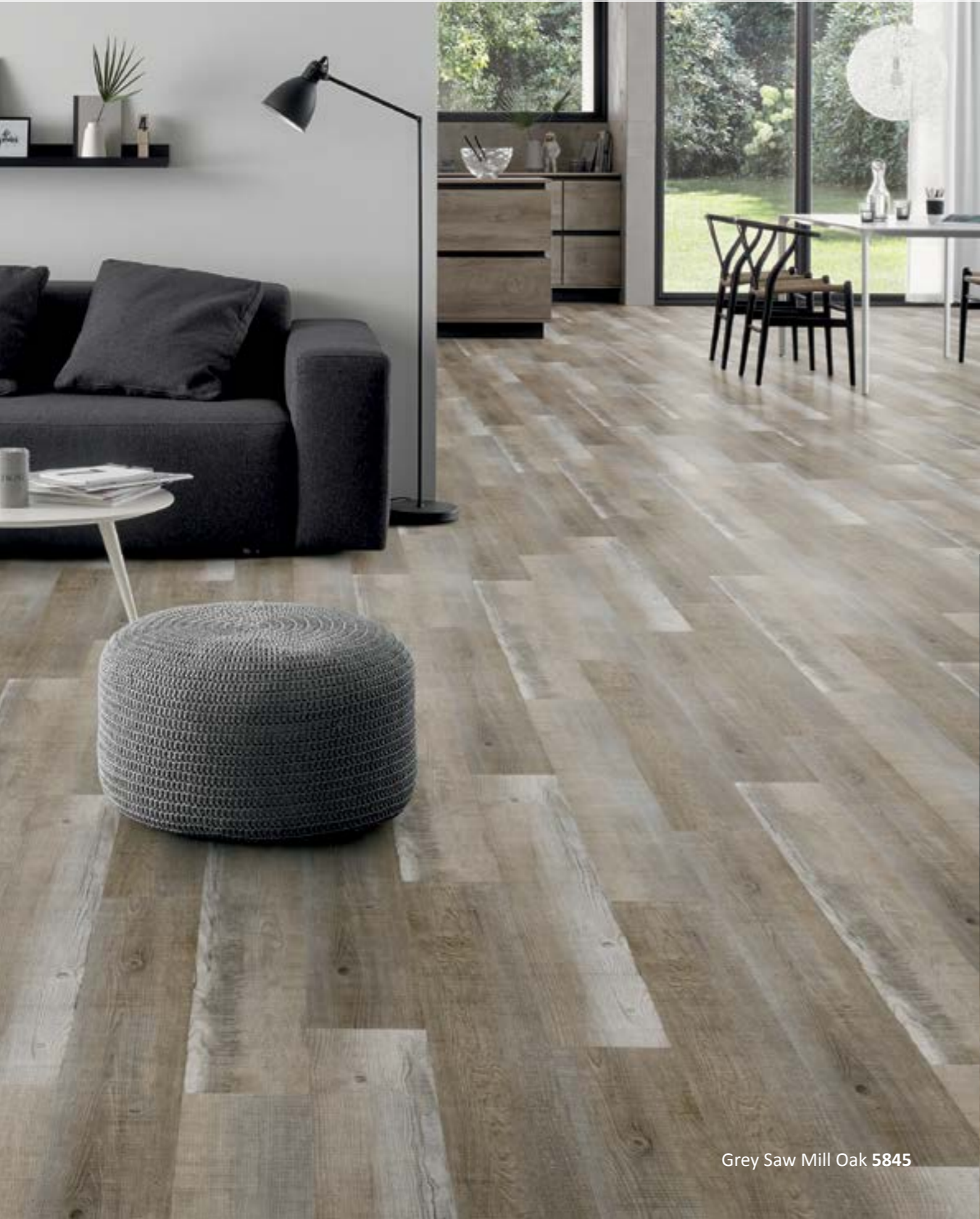
Grey Saw Mill Oak 5845

Expressive grains and textures - show character and make a statement.