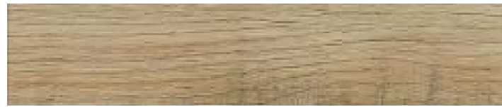
5819 Cambridge Oak Mini Parquet* 76mm x 229mm