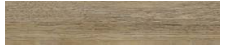
5961 Natural Brushed Oak* 203mm x 1219mm