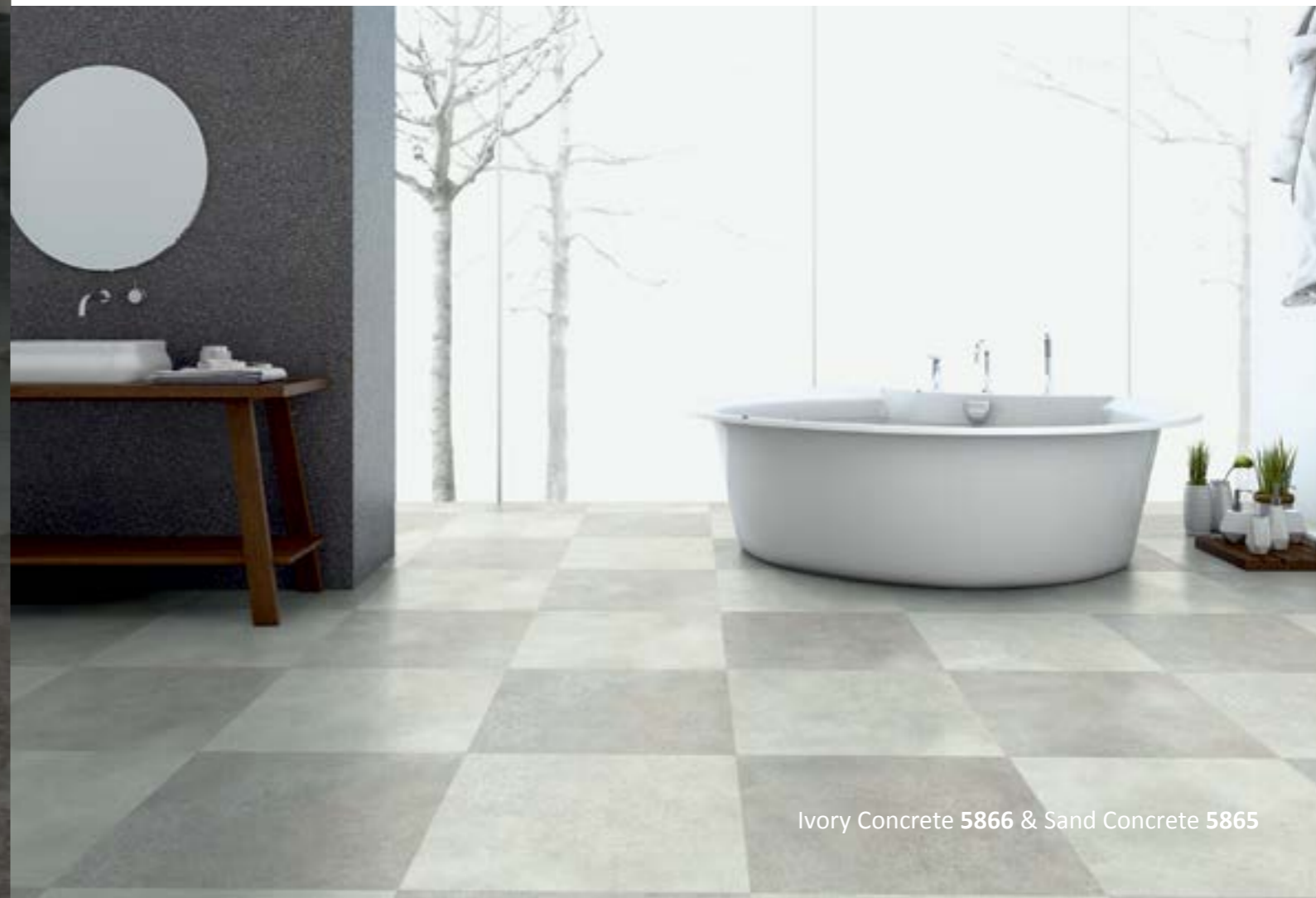
Ivory Concrete 5866 & Sand Concrete 5865