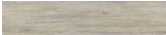
5826 Cracked Wood* 184mm x 1219mm