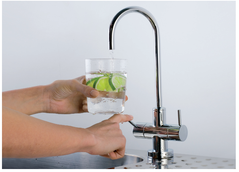
Instant chilled and ambient filtered drinking water both from the one tap!