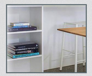
Supalam delivers peaceof-mind results for carcass and budget cabinetry. Left: Residential kitchen, (carcass). Above: Shelving, residential office bookcase.