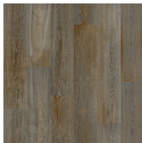
Pure Oak 670D