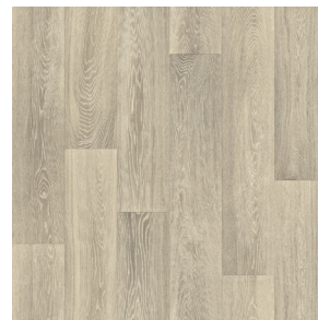
Pure Oak 190L