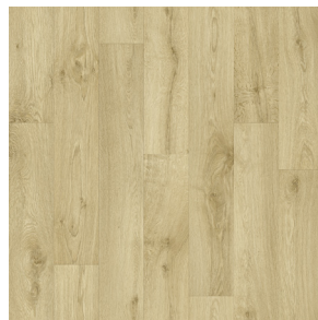
Willow Oak 163M