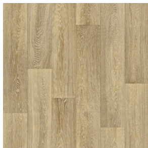
Pure Oak 160M