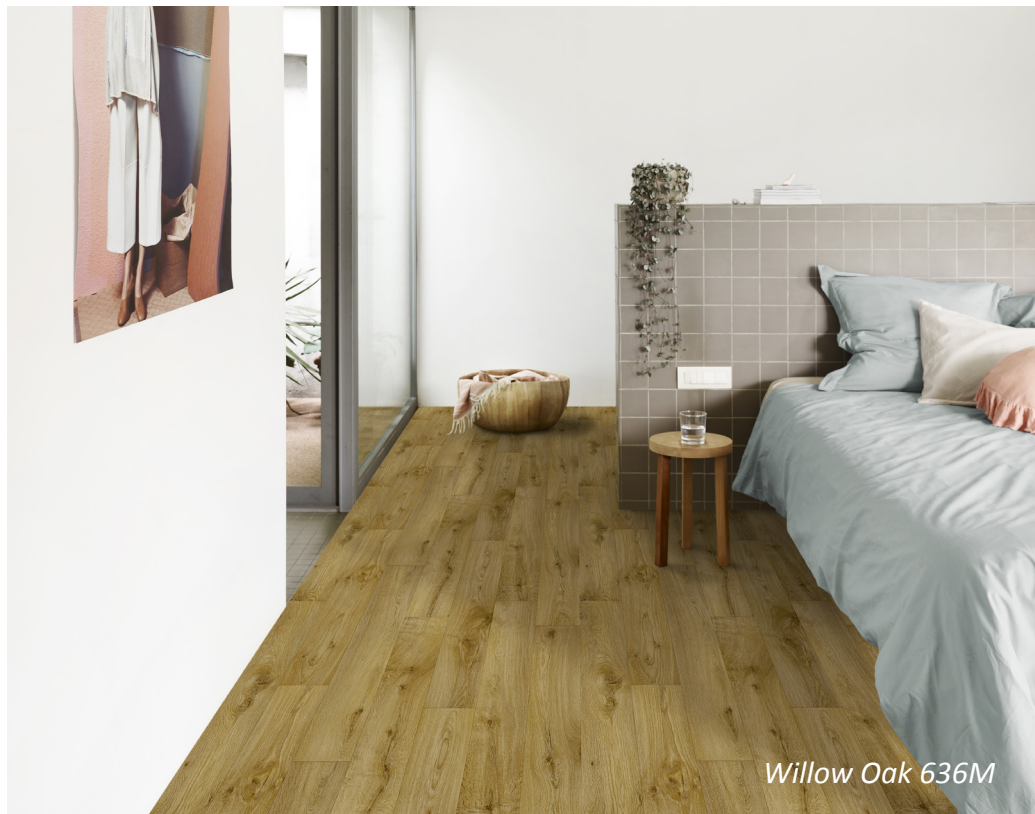
Willow Oak 636M