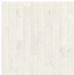
Holly Oak 001S