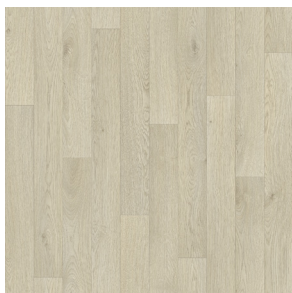
Holly Oak 193L