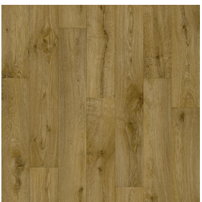
Willow Oak 636M