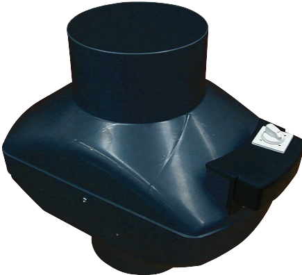
Simx 150mm WhisperVent low profile