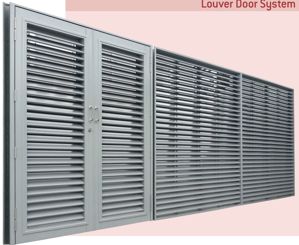
Louver Door System

*Note: Hinge Handling and Handle/Lock options are available, refer to your local Holyoake branch.