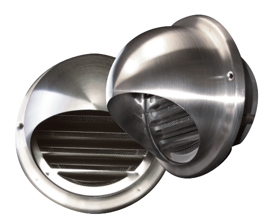
150mm Weatherproof - Stainless Dome Cowl