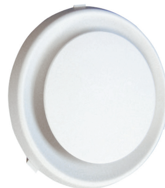
200mm Ceiling Diffuser