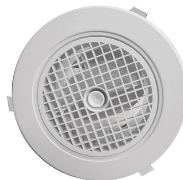
150mm Eggcrate Round Diffuser