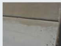
Close-up of curing differences. Surface effects can produce inconsistent colour.