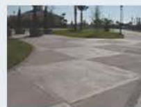
Combine different colours and textures. Break up large, integral colour projects with different colour and texture bands.