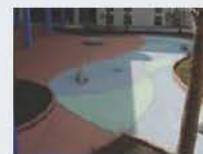
Controlling all the variables can produce large, integrally coloured concrete projects.