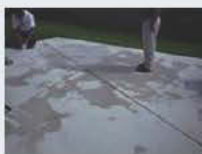
Inconsistent cure produces inconsistent colour which is much more noticeable in coloured concrete compared to grey concrete.