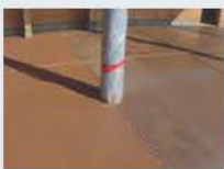
Changing cements mid-job will result in a colour difference.

- Use a sealer when concrete is laid to add sheen, highlight colour, protect the aggregate and help prevent stains such as oil leaks. Always follow the directions of the sealer supplier.