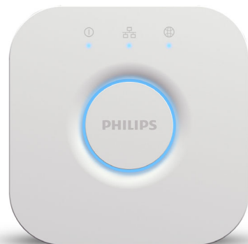
Philips Hue Bridge