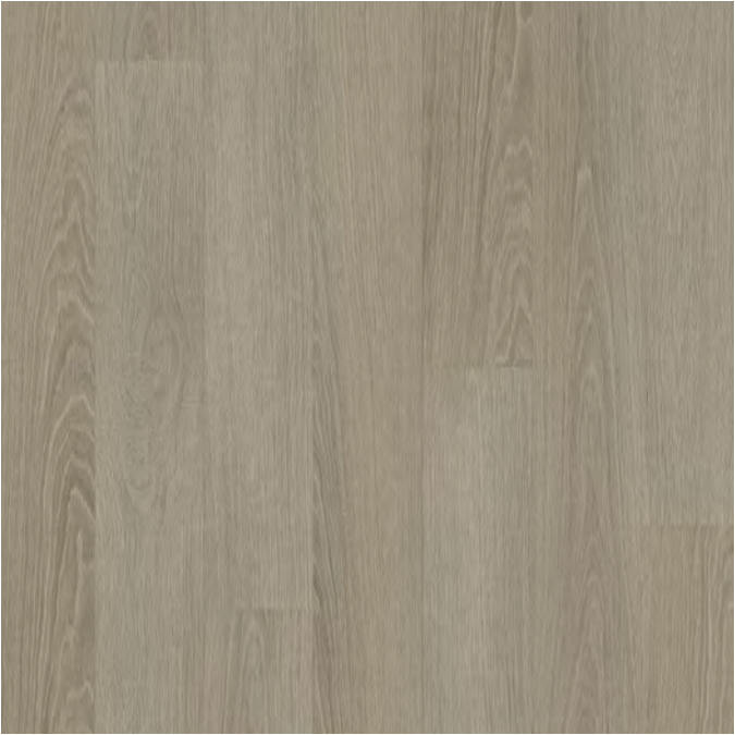
Chardonnay Oak LRV 41.86 Jamieson Oak LRV 34.3 Sierra Oak LRV 38.8 Limestone Oak LRV 33.01