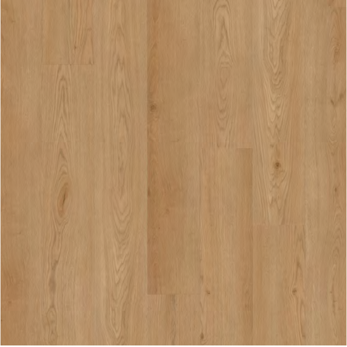
Pils Oak LRV 29.1 Booker Oak LRV 27.04 Honey Oak LRV 34.04 Euro Oak LRV 26.24