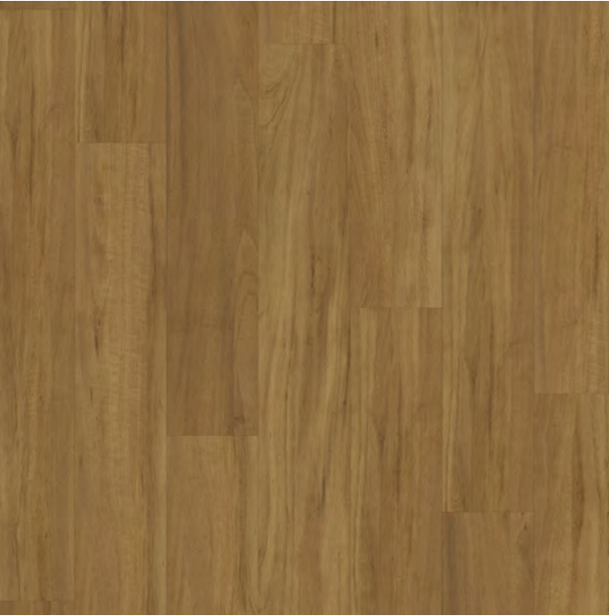
Blackbutt Traditional Strong colour variation