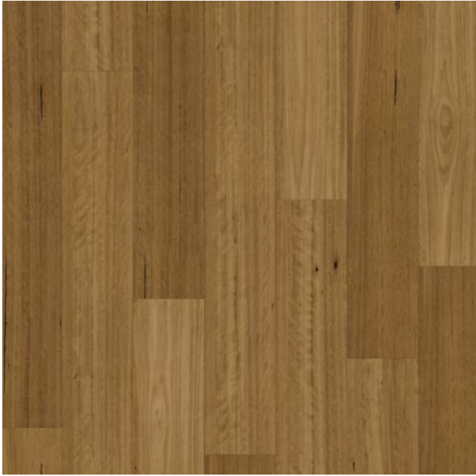
Spotted Gum Traditional Strong colour variation