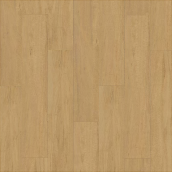
Chardonnay Oak LRV 41.31 Silver Oak LRV 38.55 Somerset Blackbutt LRV 33.64 Strong colour variation Franklin Tassie Oak LRV 37.23 Strong colour variation