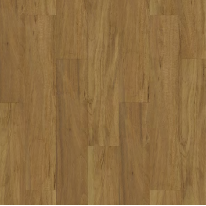
Jamieson Oak LRV 35.85 Booker Oak LRV 28.04 Euro Oak LRV 26.51 Tasmanian Hardwood Classic LRV 20.11 Strong colour variation