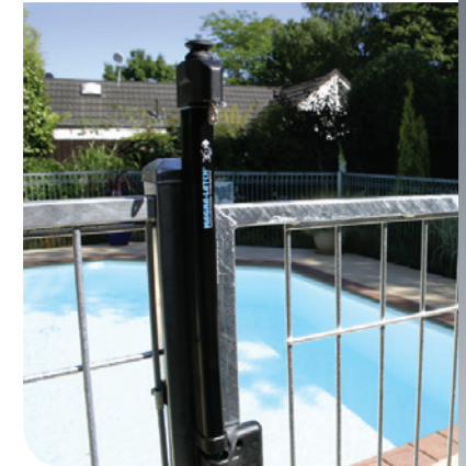
Pool Gate Latch with child proof opening mechanism.