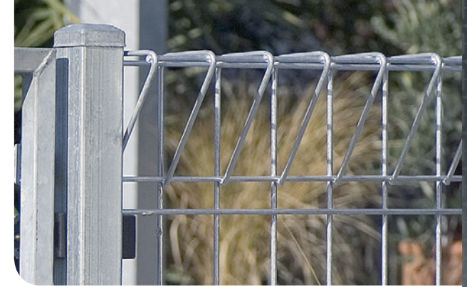
Fold Top Panels are the accepted profile recognised as a superior home and pool fence solution.