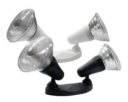
SmartLite Twin Spot Black and White