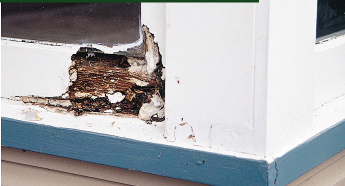
Before...showing a rotten timber frame