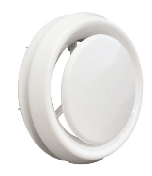
200mm Ceiling 'ECO' Diffuser