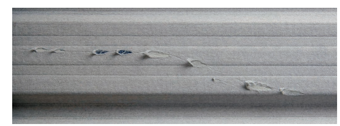
An example of minor damage that can be fixed

Minor surface scratches on the topside of the roofing sheets won't affect the corrosion inhibiting properties of the material and will become less noticeable as the coating weathers. As a result, they are best left alone. On the reverse side, minor damage to the fleece can be pressed back onto the substrate using a small rubber roller. Major damage to the top or reverse side - often caused by rough handling requires replacement of the damaged sheets.