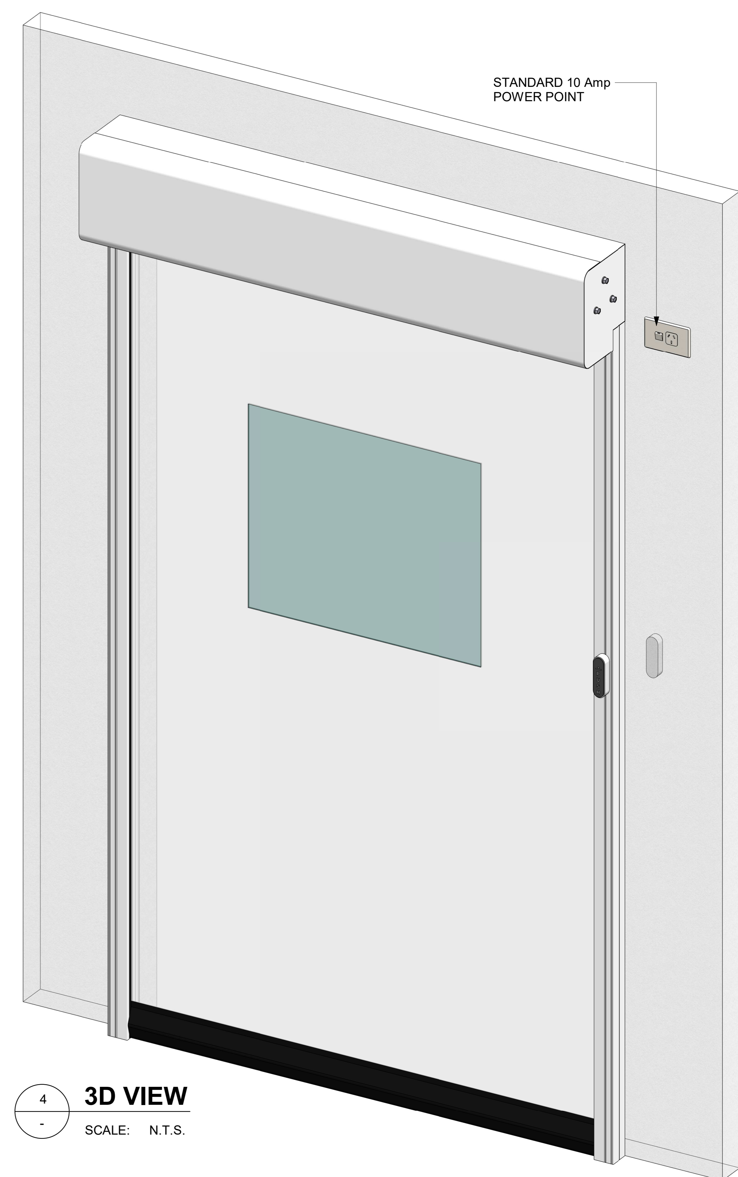
4 3D VIEW SCALE: N.T.S.