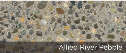
Allied River Pebble