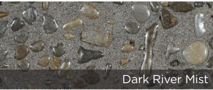
Dark River Mist