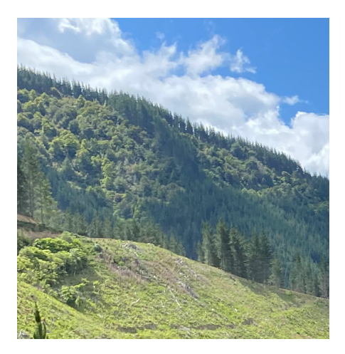
1,176,444 kg reduction of CO <sub>2</sub> emissions