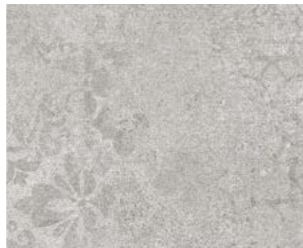
5868 Ivory Stencil Concrete 305mm x 305mm

Although we endeavour to ensure the colours depicted within this brochure represent the true colour of each product, we recommend you view an actual sample prior to selection.