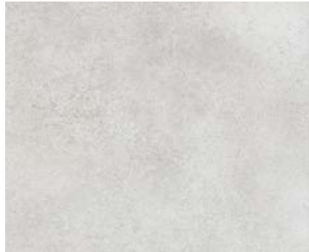
5865 Sand Concrete 610mm x 610mm