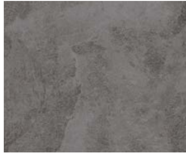
5863 Silverline Slate 305mm x 610mm