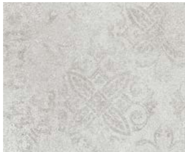
5867 Sand Stencil Concrete 305mm x 305mm