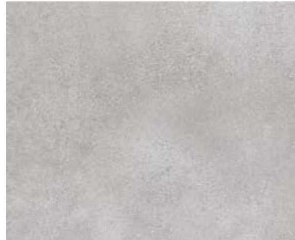
5866 Ivory Concrete 610mm x 610mm