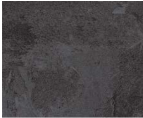
5862 Graphite Slate 305mm x 610mm