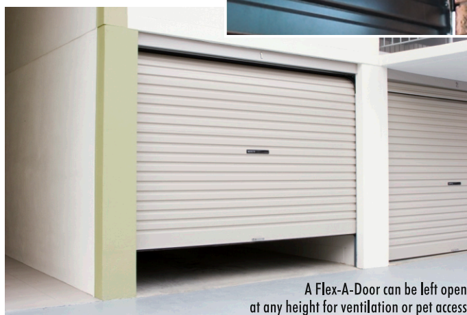
A Flex-A-Door can be left open at any height for ventilation or pet access