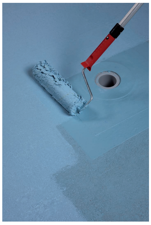
Application of the second coat of Mapelastic AquaDefense