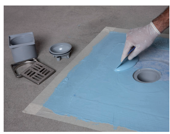
Impregnating Drain Vertical fabric with Mapelastic AquaDefense

MAPEGUM WPS, MAPELASTIC, MAPELASTIC SMART, MAPELASTIC TURBO AND MAPELASTIC AQUADEFENSE WET AREA MEMBRANES