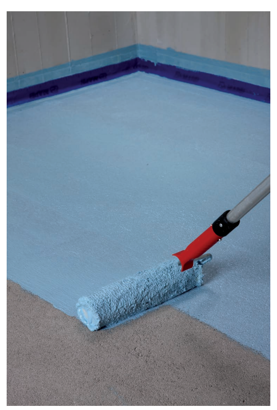
Application of the first coat of Mapelastic AquaDefense