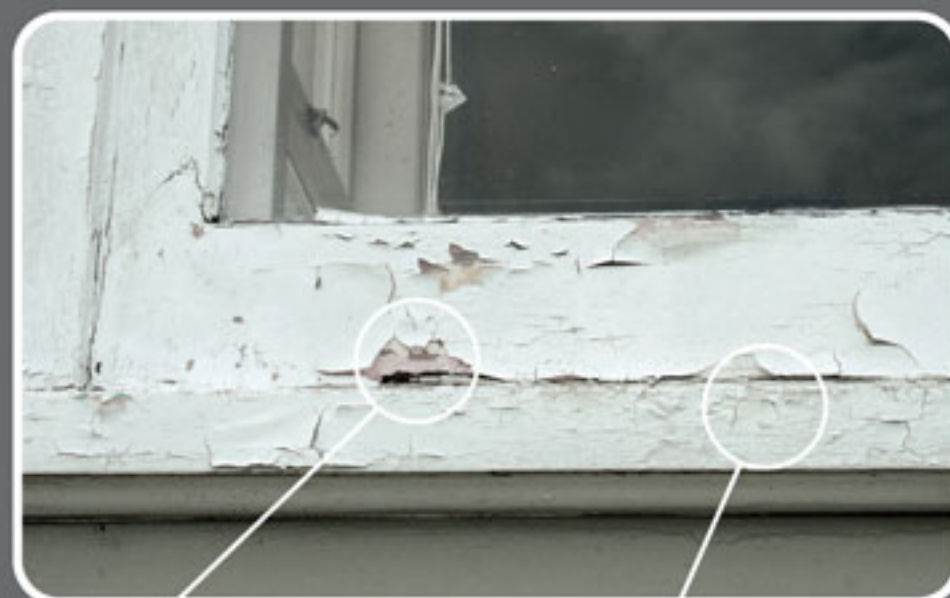
● Water seeping into walls and leaking onto window ledges ● Rotten frames

There is no need to repaint the frames - the Aluminium stays looking new for years and there is no rotting. Together with double glazing exterior noise is reduced, your home's efficiency is increased and condensation is controlled resulting in a healthy, warm, damp-free home.