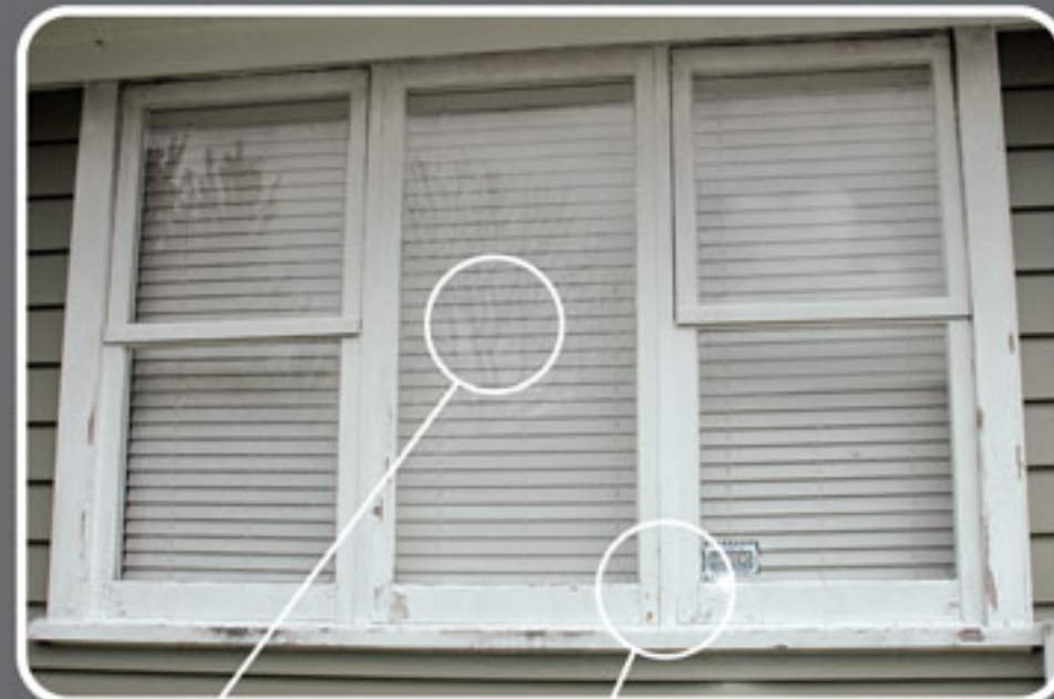
● Heat Loss ● Constant repainting

Windows like these are both unhealthy and inefficient creating a cold, damp house. The timber frames look tacky when the paint is peeling and in the long-term leads to rotting windows. Replacing your windows with Aluminium frames greatly reduces the ongoing maintenance.