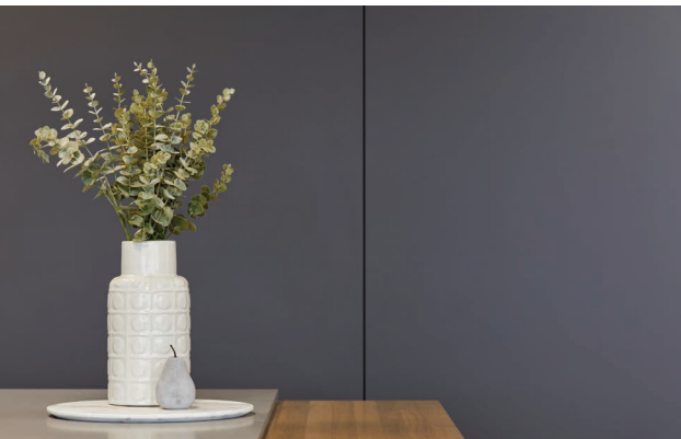
COLORSTEEL TidalDrift® Matte, Internal Insulated Panels, Pauanui