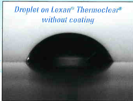
Contact angle of 66°