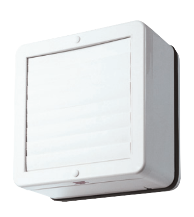
Auto Shutter Models