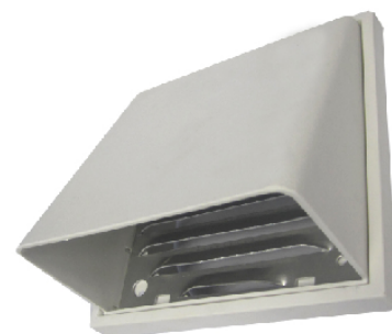
DCT1995 White Cowl with Fixed Plate

DCT3616 - Stainless steel weatherproof cowl including backdraught flap & Mesh for wall mounted applications. A stylish option for modern design & architecture. Available with mesh - no flap also.