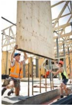
Carterton Events Centre (Carterton) LVL Shear Walls & Trusses