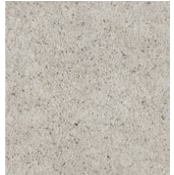
Stolit MP Natural: Coloured fine finish float, sponge or light adobe sand speckled finishing render.