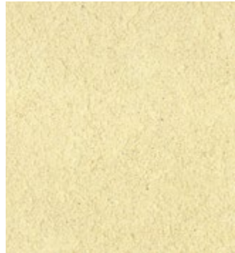
Stolit MP: Coloured fine float, sponge or light adobe finishing render.