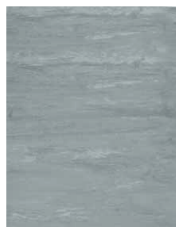
Flint 3720* w/r 3720