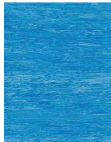
Tanzanite Blue 3750 w/r 3750