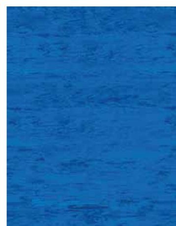
Blue Zircon 3760* w/r 8440