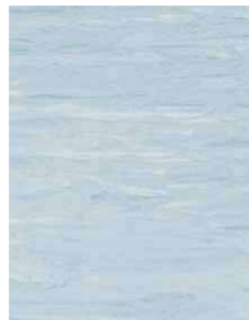
Blue Nickel 3730 w/r 5350