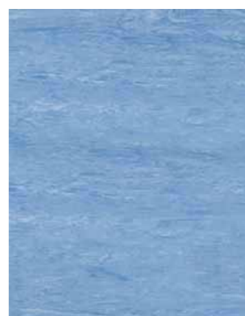
Azure 3770 w/r 3770