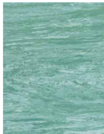
Turquoise 3810* w/r 2610