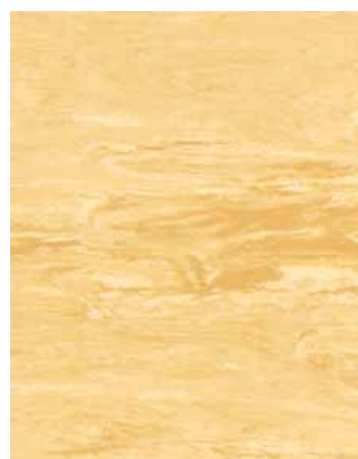
Citrine 3930 w/r 2660