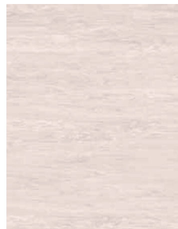
Rose Quartz 3870* w/r 3870