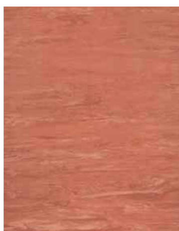
Ironstone 3850 w/r 3850