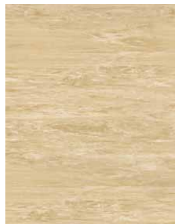
Dolomite 3910* w/r 2500