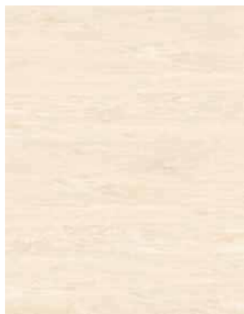
Carnelian Beige 3890 w/r 5330