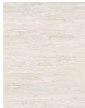
Porcelain 3880 w/r 3880