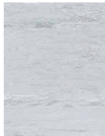
Fossil 3710* w/r 3710