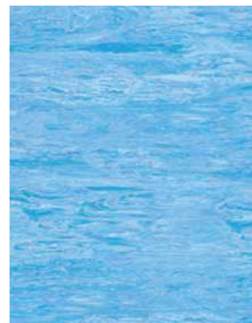
Crystal Blue 3740* w/r 3740