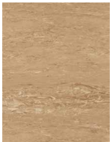
Sablee Beige 3900* w/r 2510