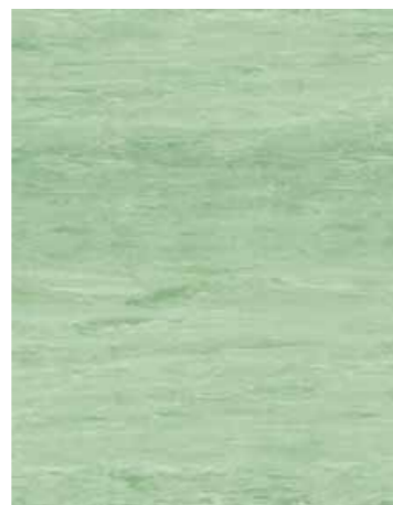
Connemara Green 3800 w/r 3800