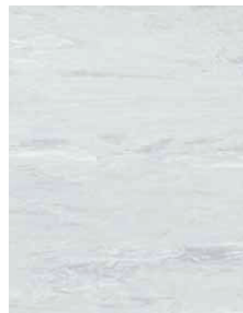
Pumice 3700* w/r 2650