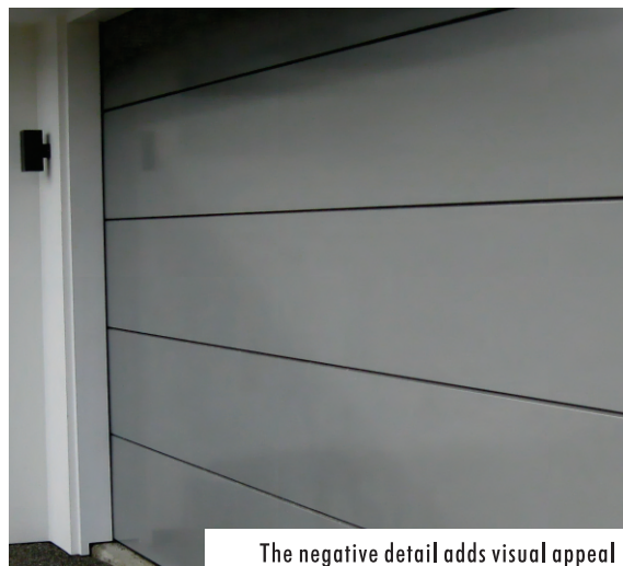
The negative detail adds visual appeal