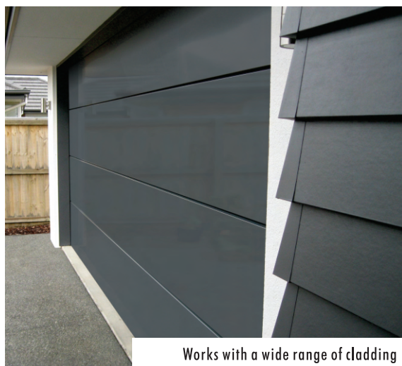
Works with a wide range of cladding