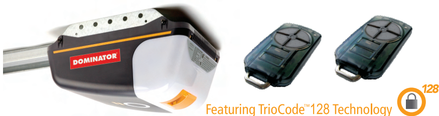
Featuring TrioCode™ 128 Technology

Basically, your kids are 23 million trillion times more likely to become astronauts than pick the correct Triocode™ 128 code combination - one less thing to worry about.