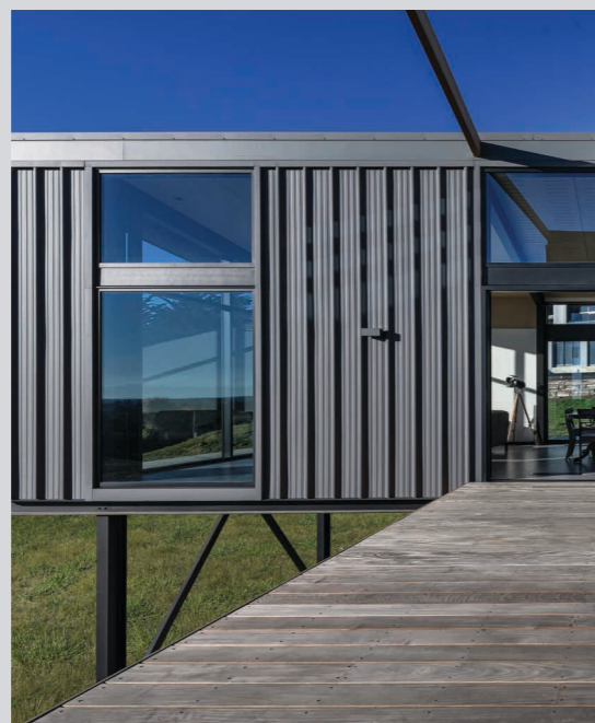
TidalDrift®Matte, Trapezoidal Profile, Christchurch