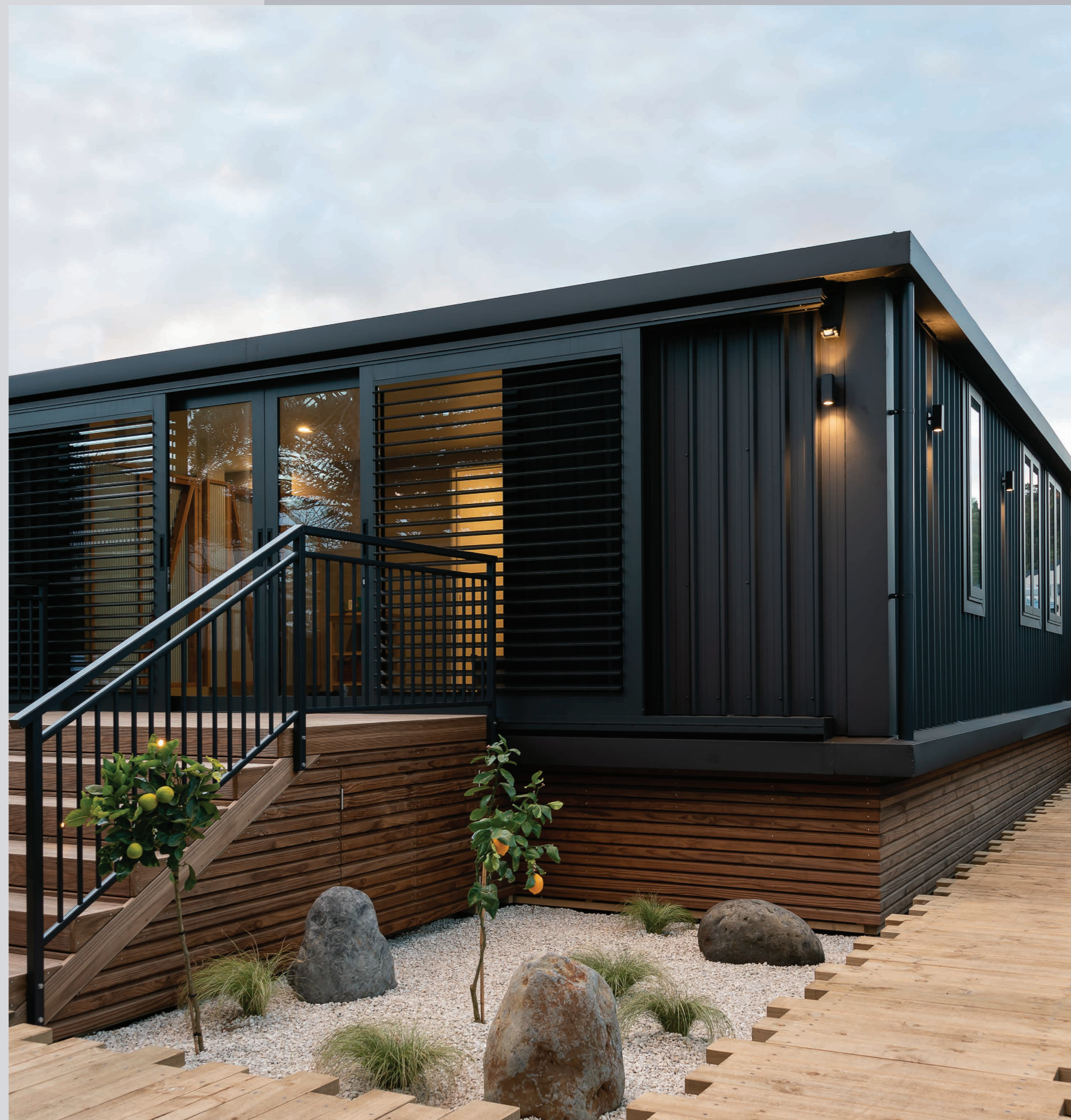
FlaxPod®Matte, Tray Profile, Waihi