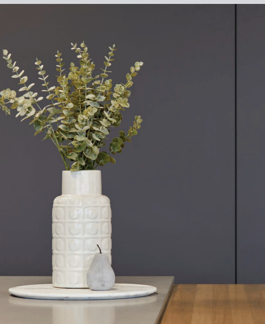
TidalDrift®Matte, Internal Insulated Panels, Pauanui

A refined choice which proves beauty is in the detail, when transforming the look of your home.