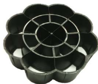
One of the media discs

Also within the aeration chamber is a large amount of 'media'. This media takes the form of large unusually shaped plastic discs. These discs bounce and float around in the circulating aerated wastewater providing extra surface area for the digesting bacteria to live on which increases the level of aerobic bacteria (bacteria with air) present in the chamber and in turn speeds up the rate at which the system can process the waste within.