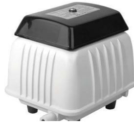
The Gardner Denver diaphragm air

compressor utilised in the system for circulating airflow into the second stage of the process provides between 60 and 100 litres per minute of air flow depending on blower size used. The air is diffused from the bottom of the vessel to aerate the contents, catalysing the digestion of remaining solids.