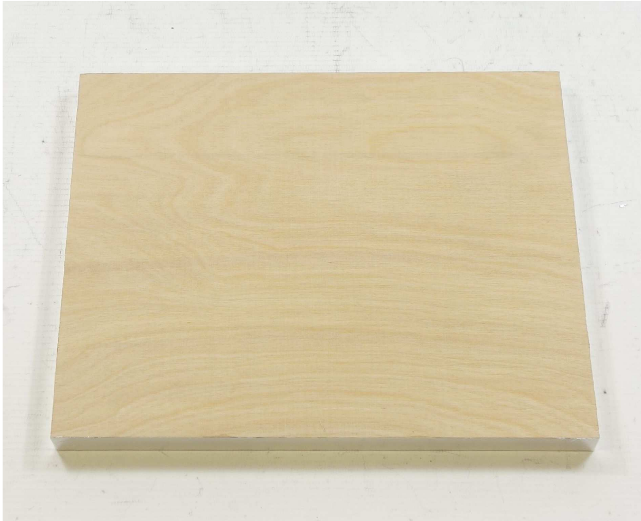
A001: Birch plywood Riga Ply BB/WG EXT-LN 18 mm