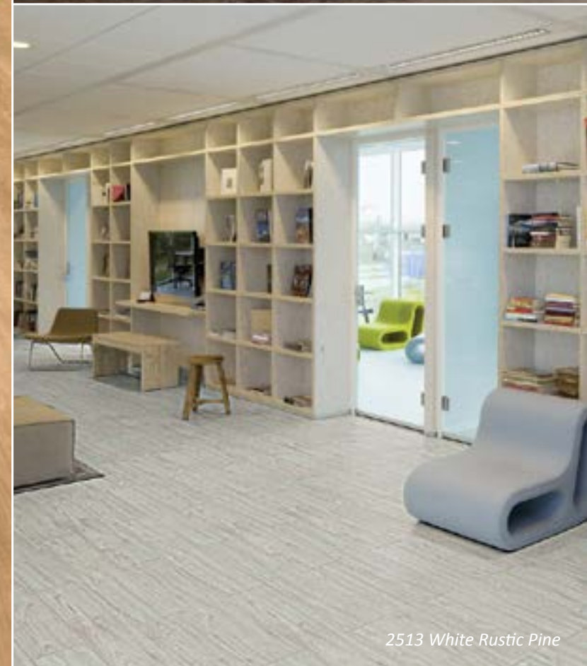
2513 White Rustic Pine