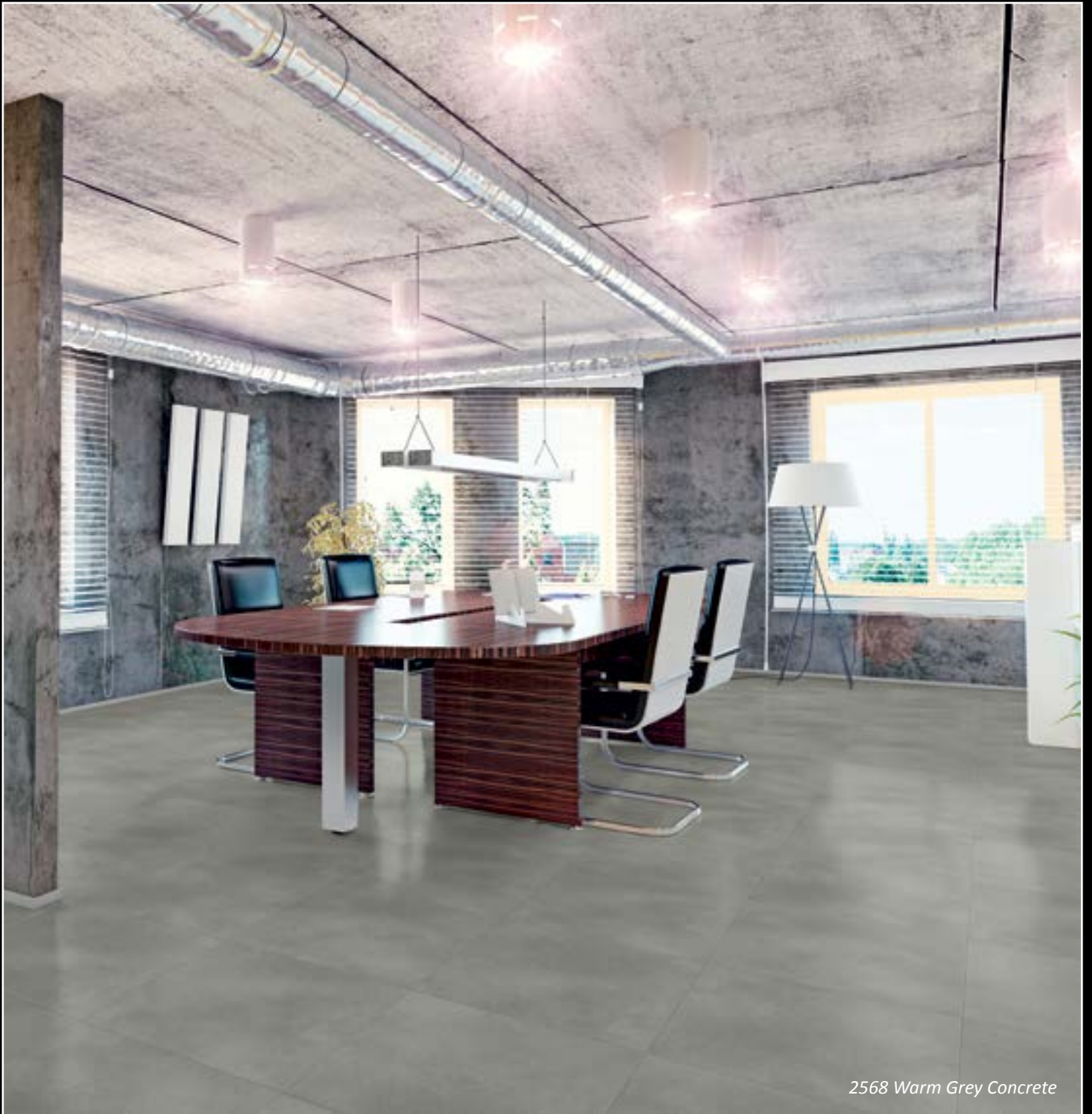
2568 Warm Grey Concrete