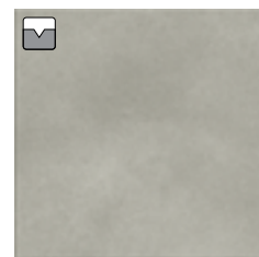
2567 Light Grey Concrete