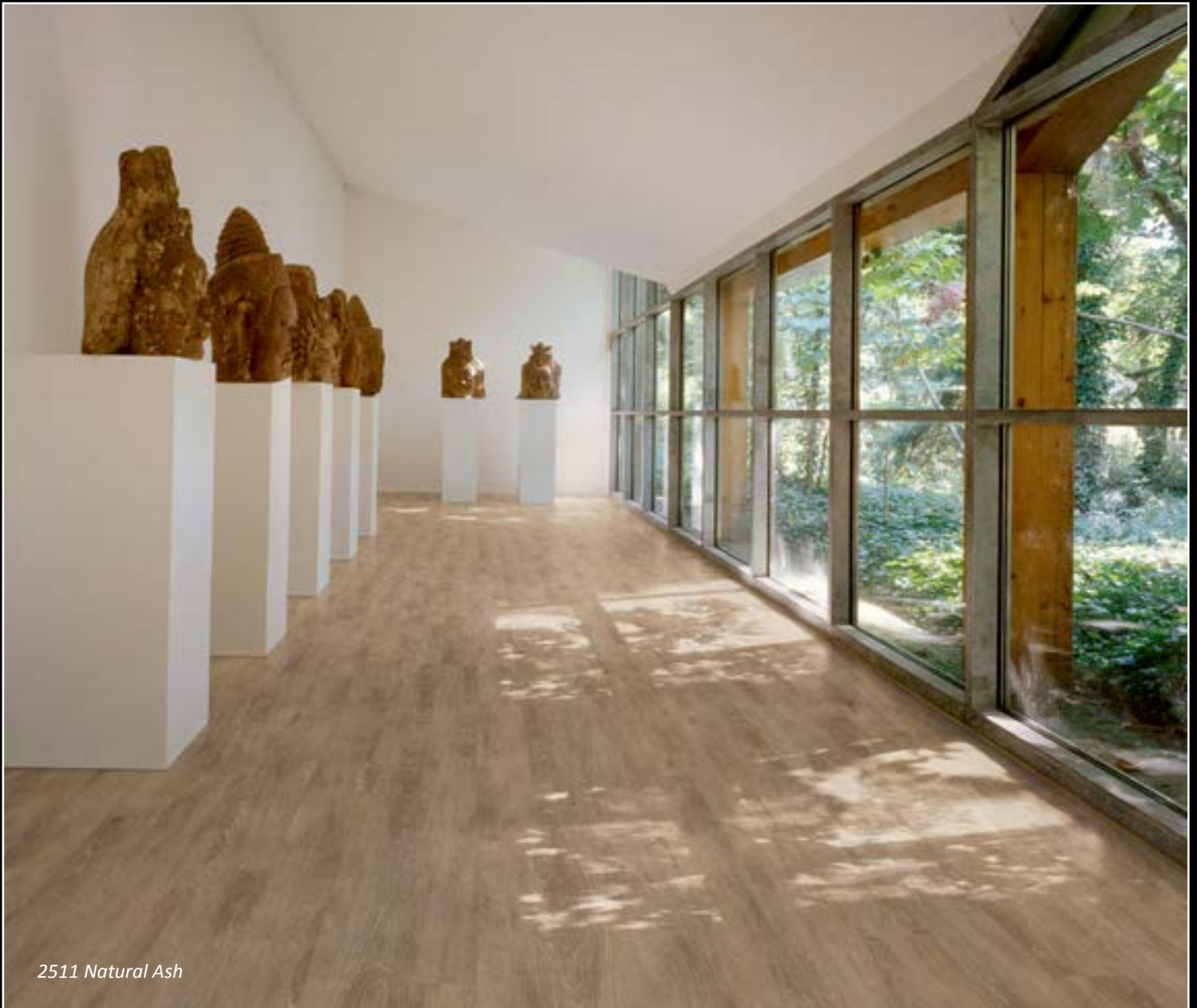
2511 Natural Ash