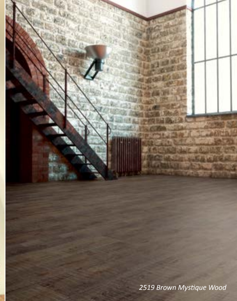
2519 Brown Mystique Wood