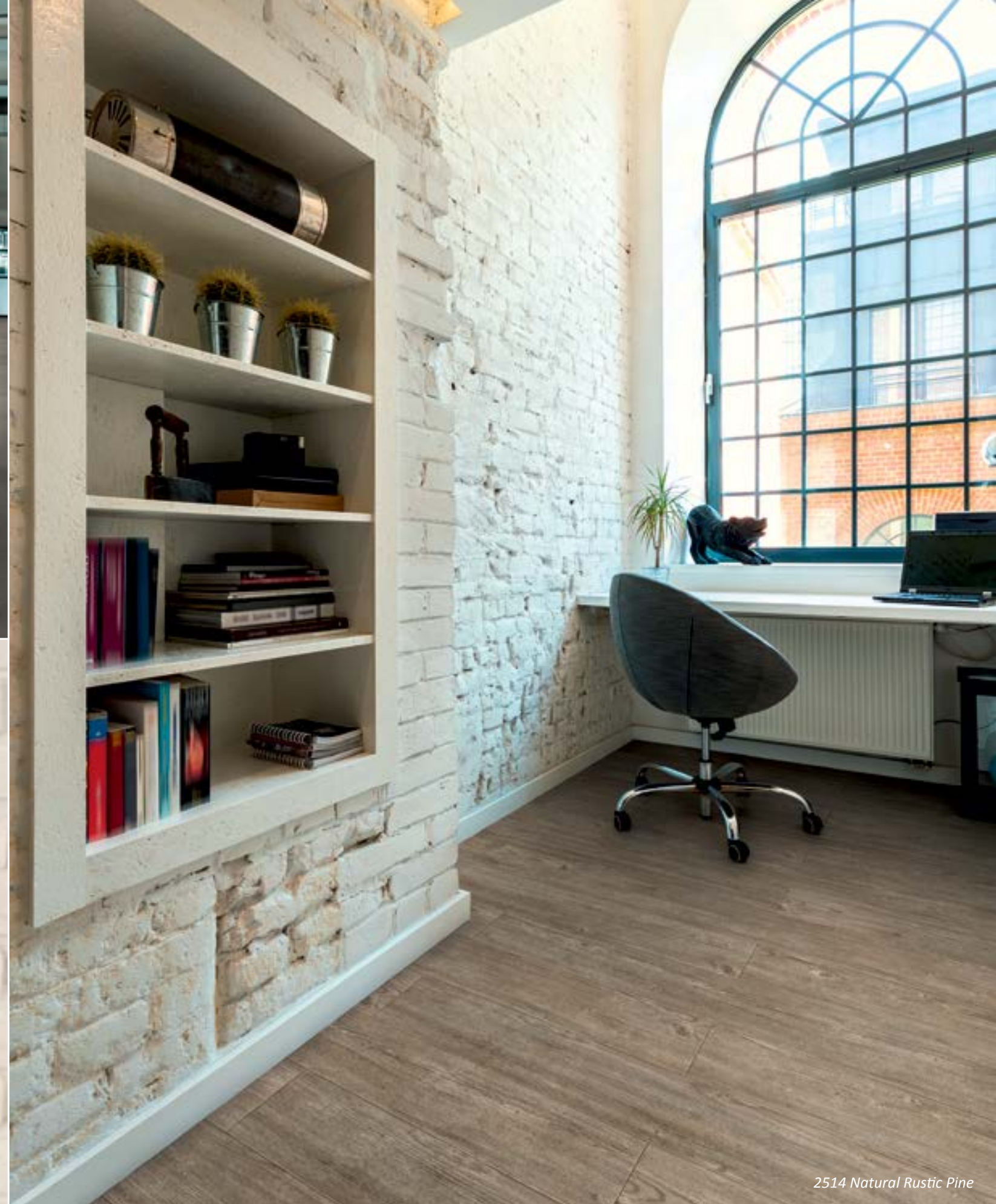
2514 Natural Rustic Pine