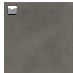
2569 Dark Grey Concrete