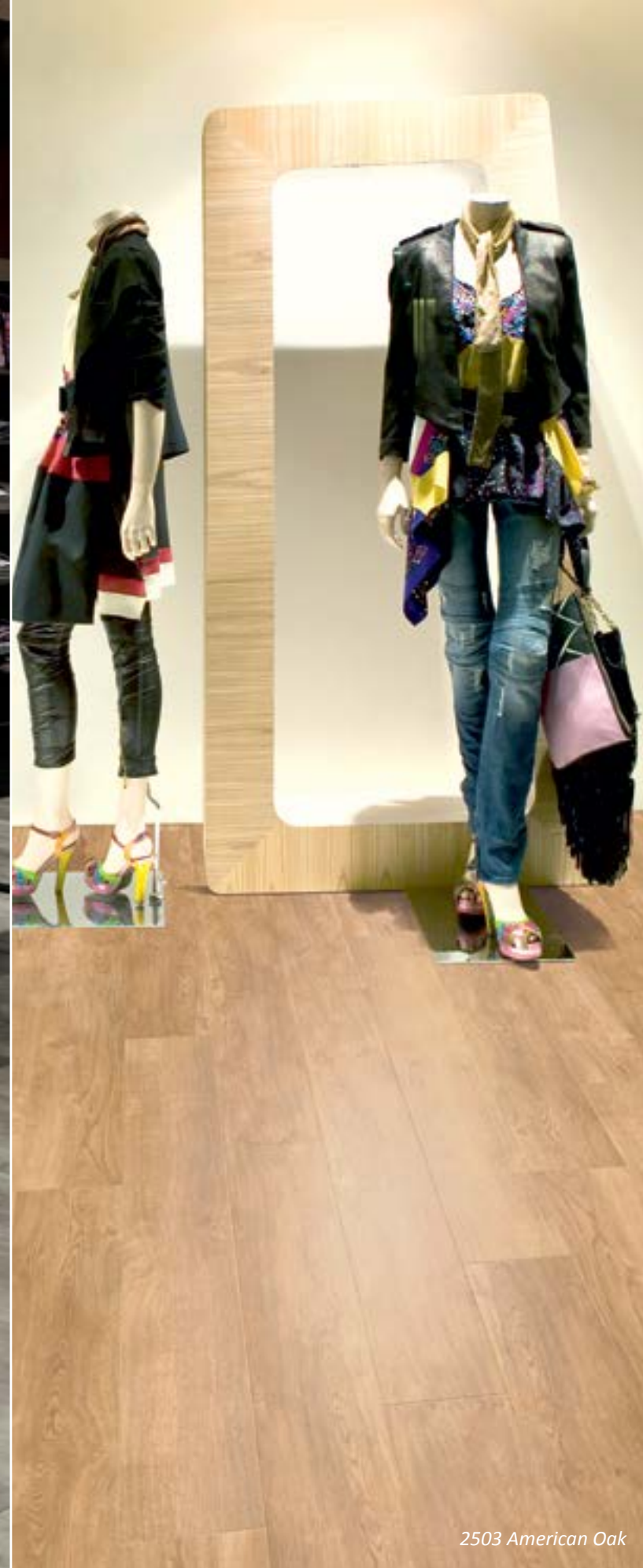
2503 American Oak

As Expona Simplay can be installed over many different types of existing floorcoverings, subfloor preparation is significantly reduced. It is a practical choice for many heavy commercial applications, including office and retail sectors.