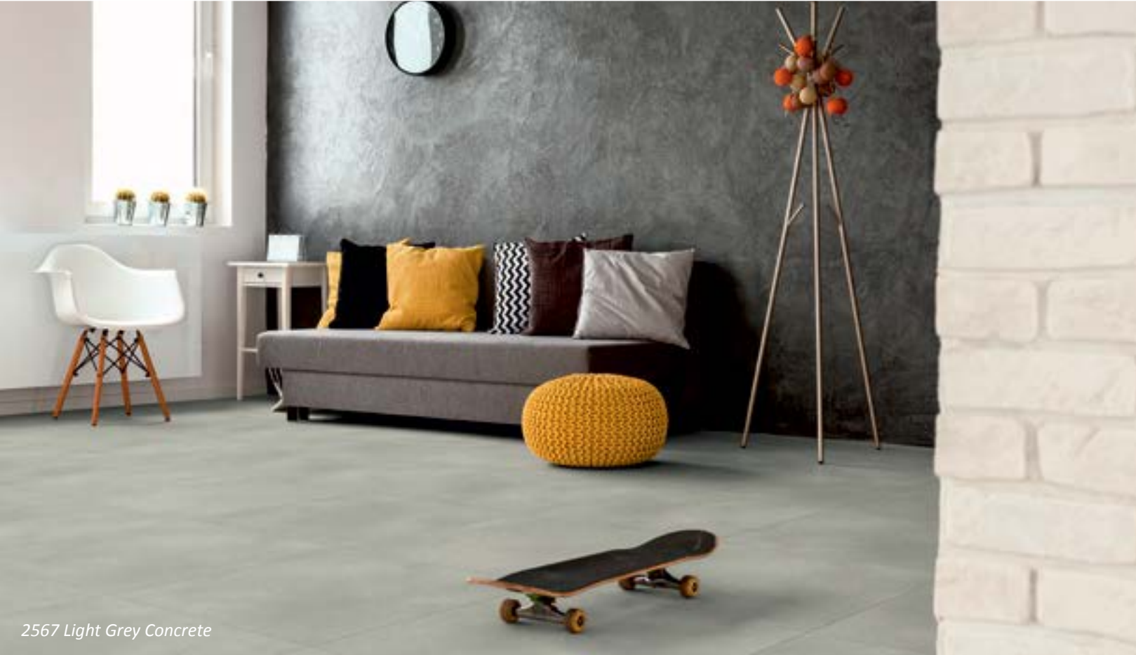
2567 Light Grey Concrete