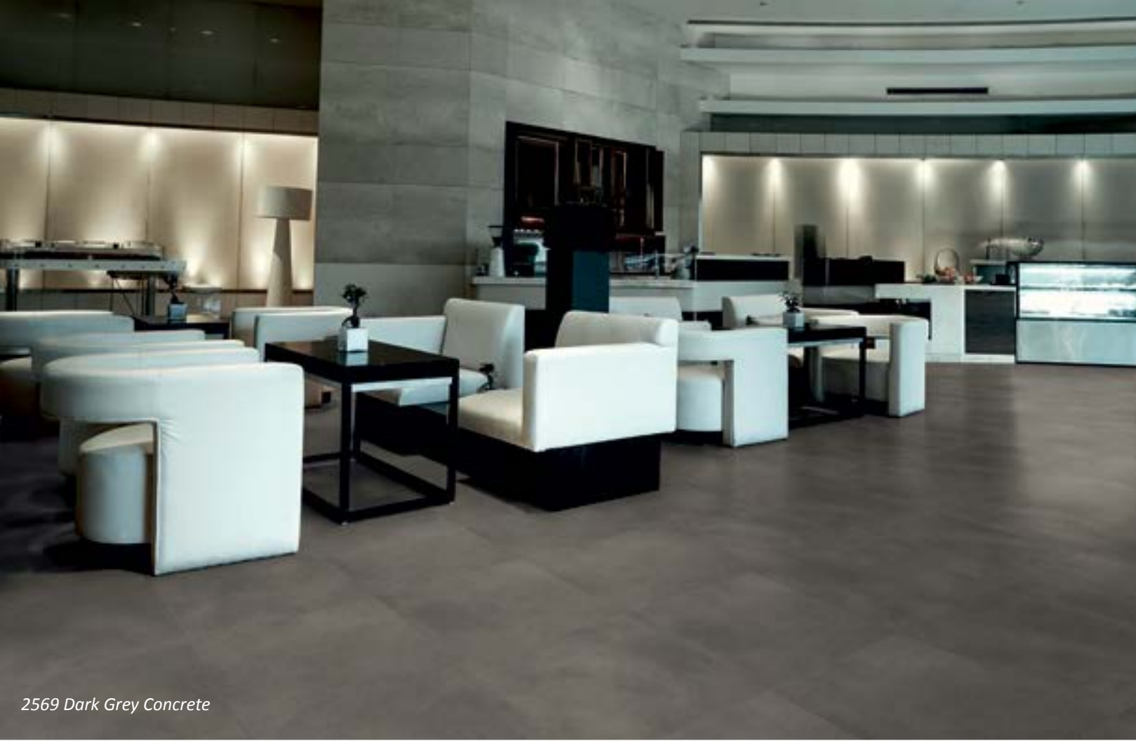
2569 Dark Grey Concrete