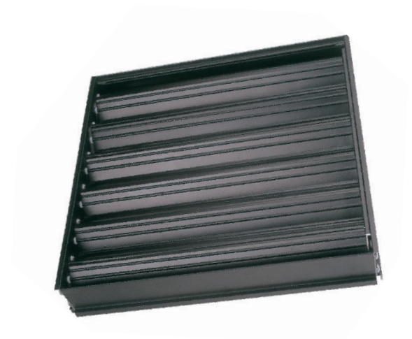
225mm x 225mm Opposed Blade Damper