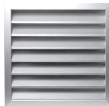
410 x 410mm Weatherproof Louvre Grille