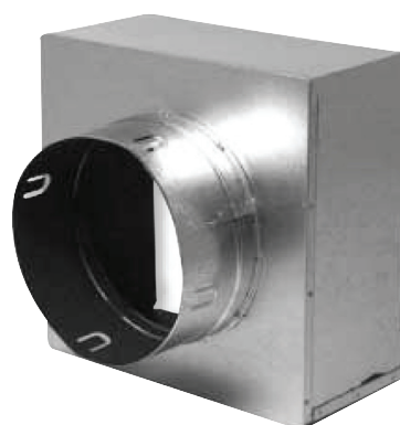
410 x 410mm Neck Adaptor for Weatherproof Louvre Grille