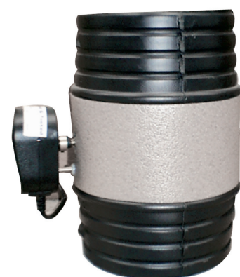
Note: These are insulated