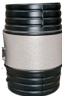
Note: These are insulated